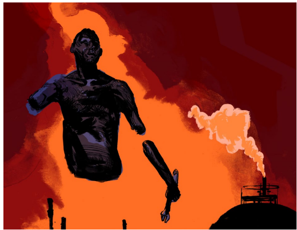
Since 2013, 33 states have cut benefits to injured workers.

Over and over again in 2015, ProPublica reporters and editors examined and distilled massive data sets to help readers make sense of important issues. We worked with Department of Education data, which involved 2,000 variables for each of about 7,800 colleges, to build an interactive database