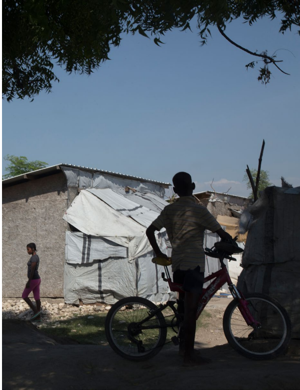
ProPublica's reporting continued to uncover management shortcomings with Red Cross relief efforts.