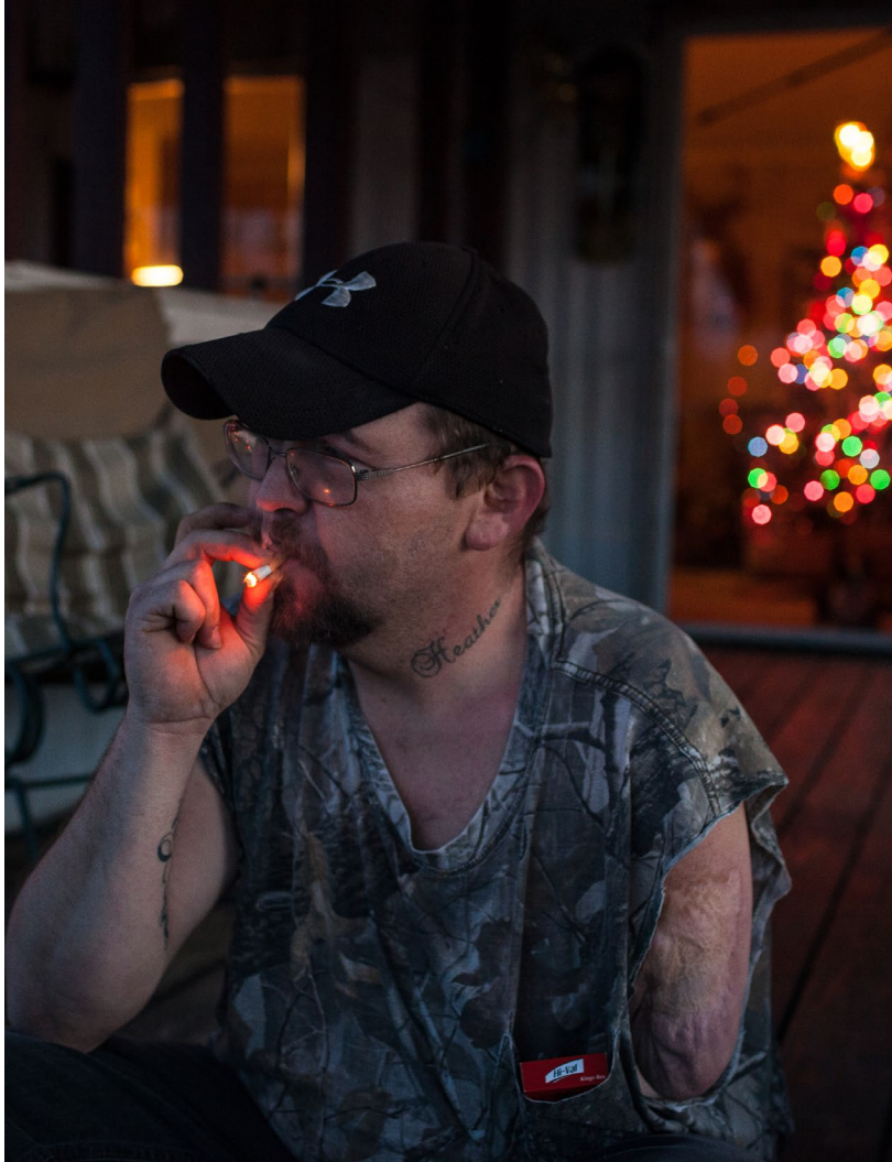
Our investigation prompted an Alabama bill to nearly triple workers' comp benefits for amputees.

debt collection system. Koster's proposals, presented to the Missouri Supreme Court's Commission on Racial and Ethnic Fairness, include a requirement for debt-buying companies to prove that they own a debt before they can sue, measures to prevent companies from winning judgments when the statute of limitations on a debt has expired, and safeguards against steep attorney's fees being passed on to debtors.