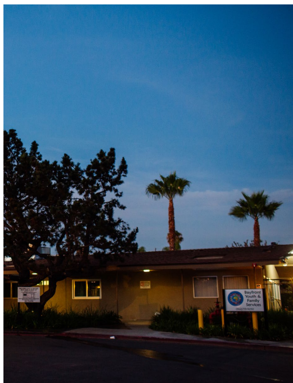
After our reporting on allegations of abuse and neglect, the Bayfront group home for troubled children was closed.

■ After a ProPublica story, published in partnership with the Washington Post, charted the harm stemming from nursing homes' failure to monitor the administration of the blood thinner Coumadin, the federal agency responsible for nursing homes formally warned them in July to be on the lookout