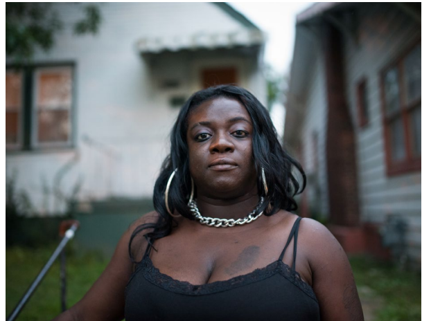
Debt collection suits were shown to be more common in black communities than white ones.

Our journalists put these findings in interactive databases of the three cities, illustrating the disparities. When Kiel spoke with the African-American mayor of the St. Louis suburb of Jennings (a single mother who had been sued over debt herself,