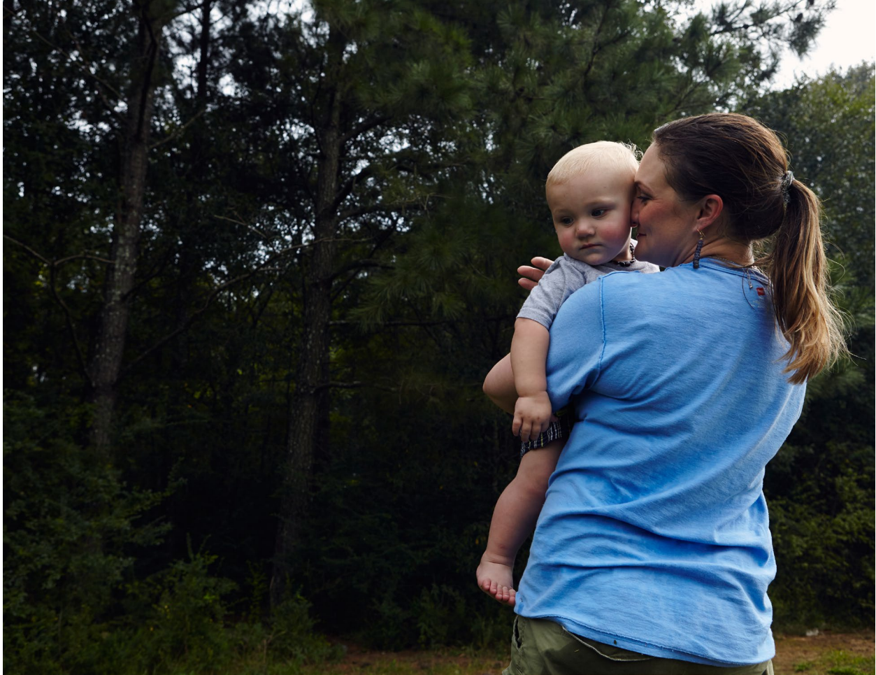
A ProPublica story highlighted overreach in an Alabama state law that makes it a felony for a pregnant woman to use drugs.

could take to decrease the incidence and severity of adverse events.”